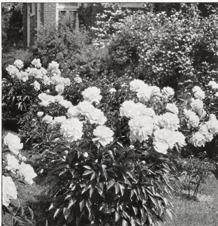
Albert Crousse Peonies